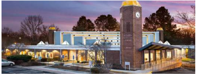
Pohick Regional Library

Pohick Regional Library 6450 Sydenstricker Rd, Burke, VA