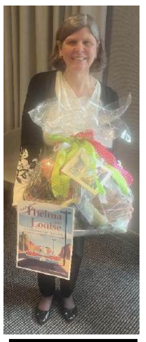
Pat with our Thelma and Louise Gift Basket