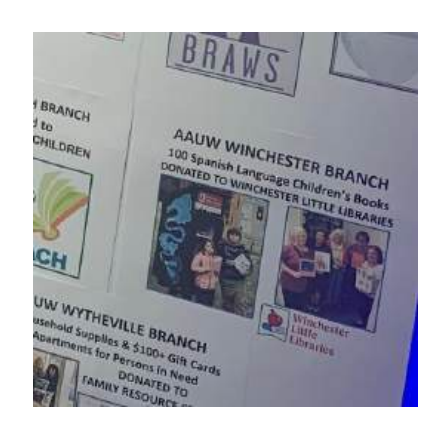
Our 100 (300) Spanish Language Children's Books Donated to Winchester Little Libraries was recognized as our contribution to the One Hundred Needed Items campaign.