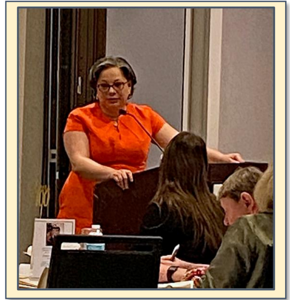
Representative Jennifer McClellan

The many speakers and panels in the AAUW Virginia 100th Anniversary meeting presented many interesting suggestions on how we can continue changing the conversation. We cannot backdown. We cannot give in. "The Second American Revolution" is up to all of us. We will have to march or advocate. We are not, however, starting over. In this new century of the Virginia AAUW, we have more power and more strength. But we can't fight alone. Our organization needs to join coalitions. We need to fight against the propaganda, the lies, and the laws aimed to take away our political power. The National government wants to require new documents to prove US citizenship in order to vote. This will make it harder for some to exercise their constitutional right to vote. We must advocate for change. Let our local, state, and national elected officials know how we stand. If the Federal government resists, then we need to fight on the local and state levels. Our Branch and others need to plan community outreach. The Virginia AAUW offers annual grants for community projects.