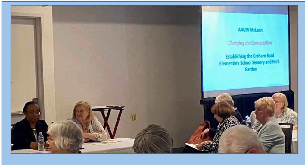
AAUW McLean presentation on Graham Elementary School Sensory Garden

efforts. We need to encourage new members to join and fight with us and our coalition partners to resist the backlash and continue forward to protect DEI and the laws that guaranteed our freedom and our rights.