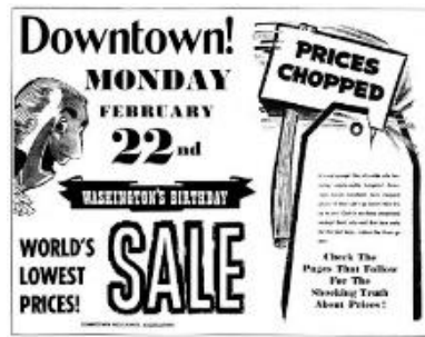
Washington's Birthday Sale Ad Washington Post 2-22-1960

While the day was grossly commercialized and our childhood lessons were mostly fiction, it was then a day off from work. Many communities, especially in Virginia, had parades, special events and even fireworks on that day. We shared in the excitement of searching for the "best deals" at George Washington Birthday Sales and ate cherry pie. Washington was held in high esteem, certainly more than a mere