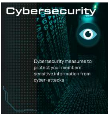
Cybersecurity for branches

You've heard of Ted Talks? Tess Talks? Teddy Talks? Like those, our Ten-Minute Toolkits will be brief, brilliant and guaranteed to blow you away. Topics are being added – here are just three examples: