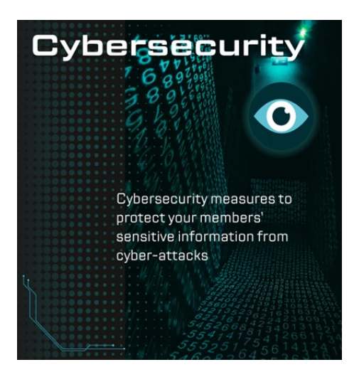
Cybersecurity for Branches