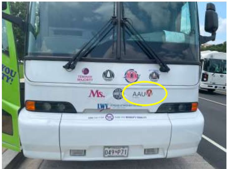
Photo: ERA Centennial Bus