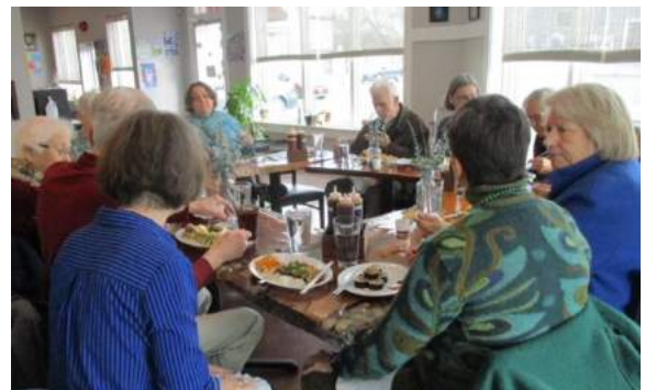
Casual lunch at Mashita's Korean Restaurant in Harrisonburg