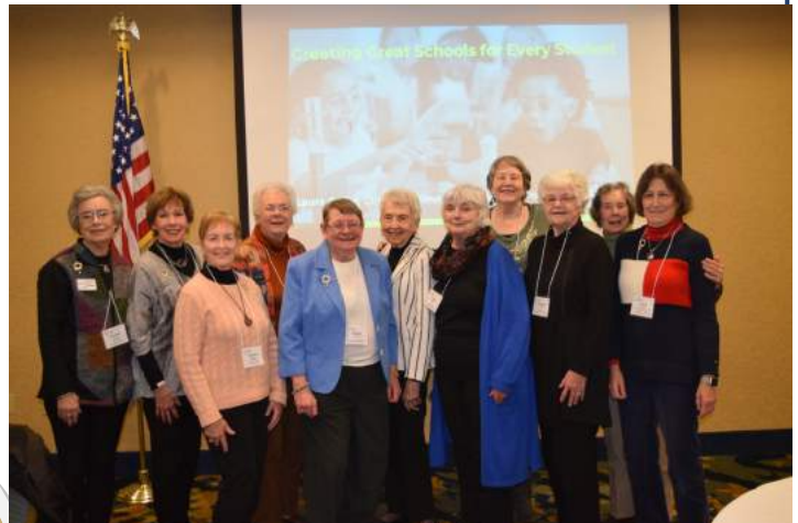
Above, left to right, past state presidents: