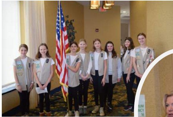
Posting of the Colors: Colonial Coast Girl Scout Troop 1087