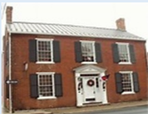
Hardesty Higgins Visitor Center 212 S. Main Street

This region of the Shenandoah Valley has its own vibrant energy and a reputation for beautiful scenery, a variety of cuisines, breweries, wineries, hiking and biking trails, parks, historical sites, and fine museums. Among the many choices are Downtown Historic Harrisonburg, Explore More Discovery Museum, Virginia Quilt Museum, Rocktown Historical Society Museum, Silver Lake Mill, White Oak Lavender Farm and Purple Wolf Winery, CrossKeys Vineyards, Bluestone Vineyard, Bridgewater Riverwalk, Shenandoah National Park and Skyline Drive, Hillendale Park and trails, and the Carrier Arboretum. For more inspiration explore this link: https://www.tripadvisor.com/Attractions-g57809-Activities-Harrisonburg_Virginia.html