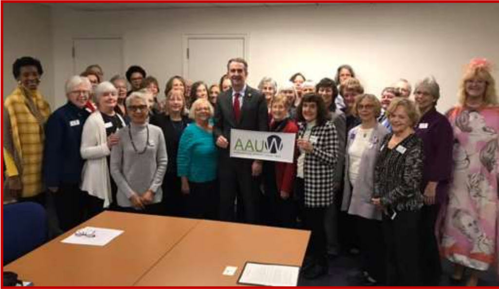
AAUW –VA members with Governor Northam on Lobby Day, January 15, 2020.

January 15, 2020 - a red-letter day in Richmond! A new day, a new month, a new year, a new decade, a new ERA! Virginia's House of Delegates and Senate voted to ratify the ERA, making Virginia the 38 th and last state needed to ratify the amendment to the U. S. Constitution. AAUW of Virginia was proudly present. Nearly 40 volunteers from 13 branches gathered in Richmond for our first 2020 State Lobby Day. Little did we know when we scheduled this first Lobby Day of this General Assembly session that our visit would coincide with Virginia's approval of the ERA!