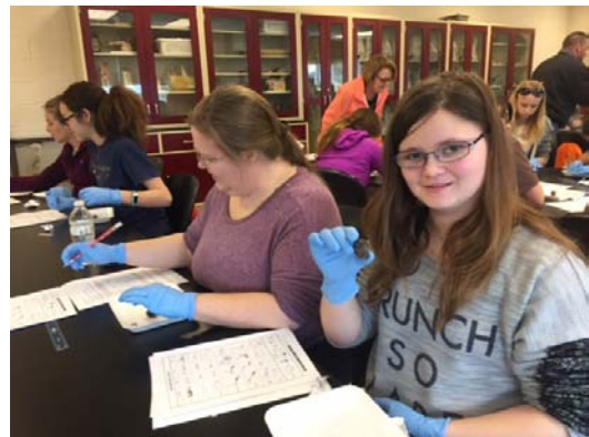
Students examining owl pellets

For the first time, we collaborated with WCC. The results were amazing! Not only did they help fund the event, their promotions added a much broader scope for our advertising efforts.