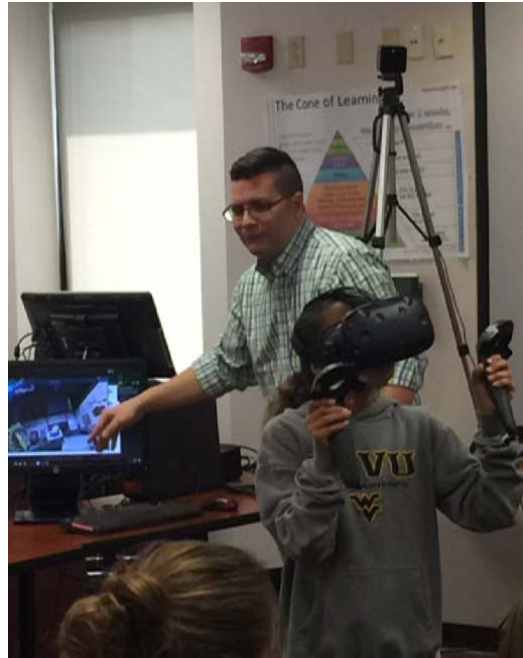
Virtual Reality workshop, which was a big hit.