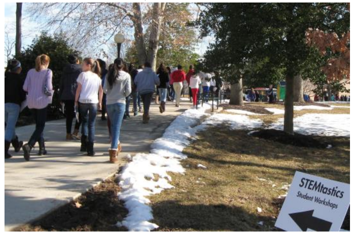
Girls on their way to the STEMtastics workshops

The Wytheville Branch once again this year presented two $50 awards at the 2014 Blue Ridge Highlands Regional Science Fair at Radford University in March. The recipients were two female high school stu-