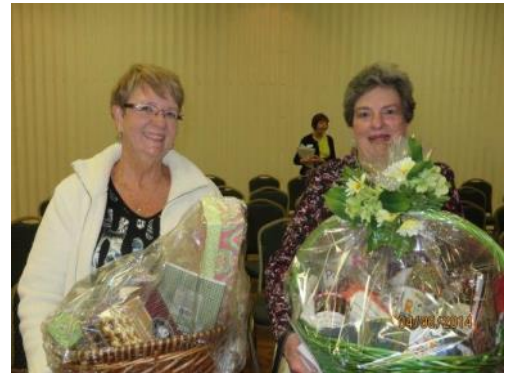
Lucky basket winners