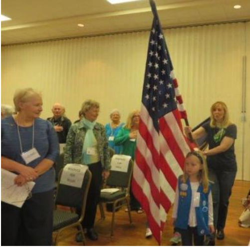
Flag presentation by Daisy Girl Scout Troop 186