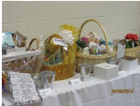
Basket raffle raised $1,201 for AAUW Funds