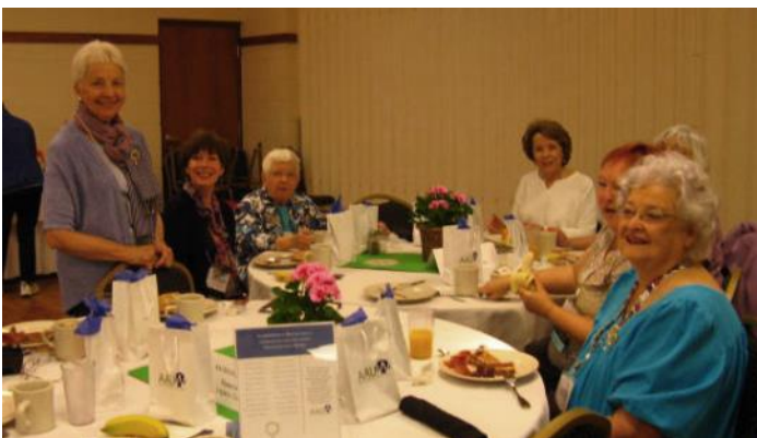
Legacy Circle Breakfast