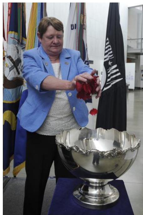
Rose petals in memory of fallen shipmates