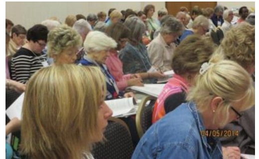
AAUW of Virginia members at the conference