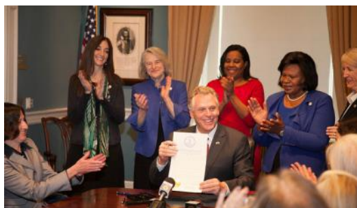
Governor McAuliffe holds up signed Equal Pay Proclamation