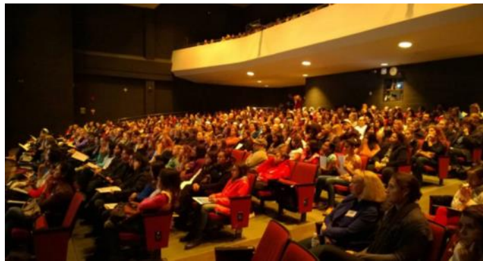
STEMtastics opening session at NOVA Annandale campus

Funding was achieved by obtaining donations and students were charged a nominal fee for attendance based on their ability to pay. Branches also received AAUW of Virginia impact grants.