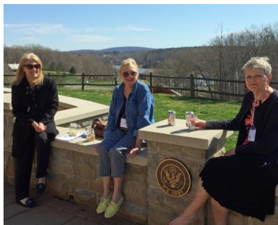
AAUW of Virginia members enjoying free time on Saturday

Sunday's wrap up was a panel discussion of the 50th Anniversary of the Civil Rights Act and its affect on Virginia. It was great fun, informative, and a great value, as well as a venue to meet old friends and make new ones. The conference next year will be held in Charlottesville on April 18, 2015, sponsored by the Northwest District.