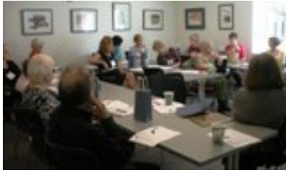
Northwest District Meeting

and Chair of the Harrisonburg Democratic Committee, talked about the structures and processes of voter registration.