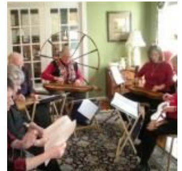
The Blue Ridge Mountain Dulcimer Club