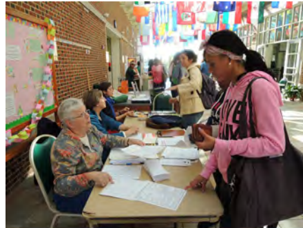
GOTV at Sweet Briar College, August 31

Lynchburg Branch participated in voter registration events at area colleges and universities this fall as part of the AAUW of Virginia Get Out the Vote project. The League of Women Voters of Lynchburg joined us in this initiative. We were part of student involvement fairs at Sweet Briar College, Randolph College, and Lynchburg College at the beginning of the fall semester. Then, in early October, we staged registration drives at lunchtime at Virginia University of