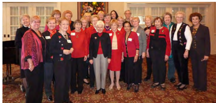
Annual holiday luncheon at Riverbend Country Club on December 16

efforts as follows: two thirds of the net proceeds to AAUW Funds and the remainder in offering four local scholarships—two for George Mason University and two for Trinity College returning women students.