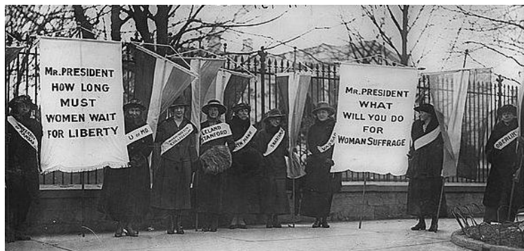
Women picket in front of the White House for their right to vote in 1917

Your branch can participate. Collect at a meeting, pass a hat, have a raffle, or drop a personal check in the mail. Send your