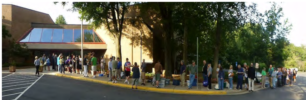
People waiting in long line at 9 a.m. on Friday, September 14

This year, the McLean Area Branch allocated its fundraising